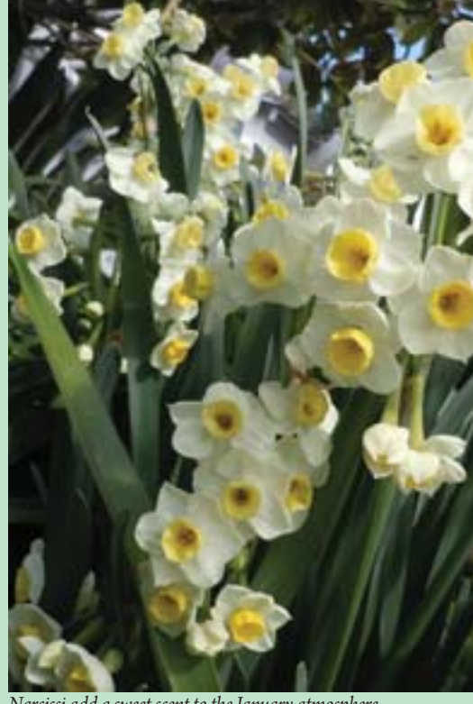
Narcissi add a sweet scent to the January atmosphere.