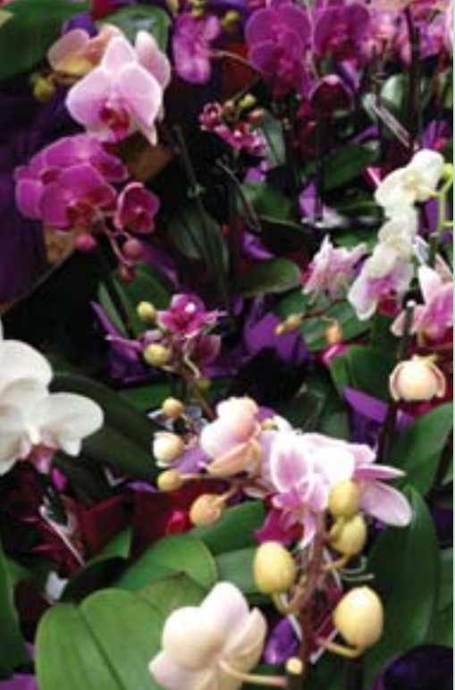
Orchids are showing up in stores in January.